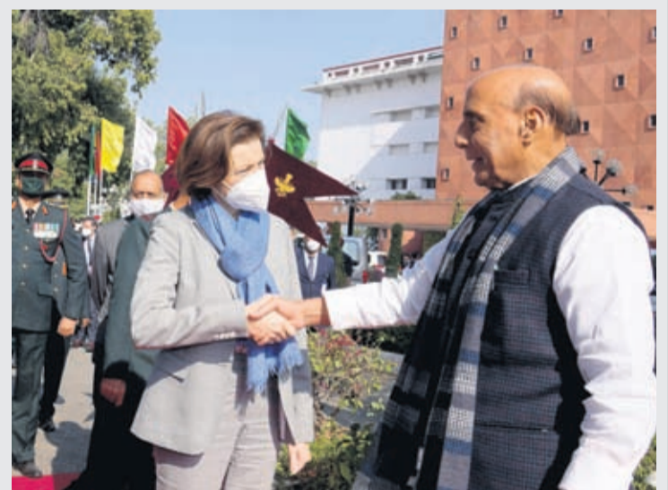
India's defense minister Rajnath Singh, right, shakes hands with his French counterpart Florence Parly upon her arrival for a joint military guard of honour in New Delhi, India, Friday, Dec. 17, 2021.

France has emerged as a major source of foreign direct investment for India with more than 1,000 French companies already active in the coun-